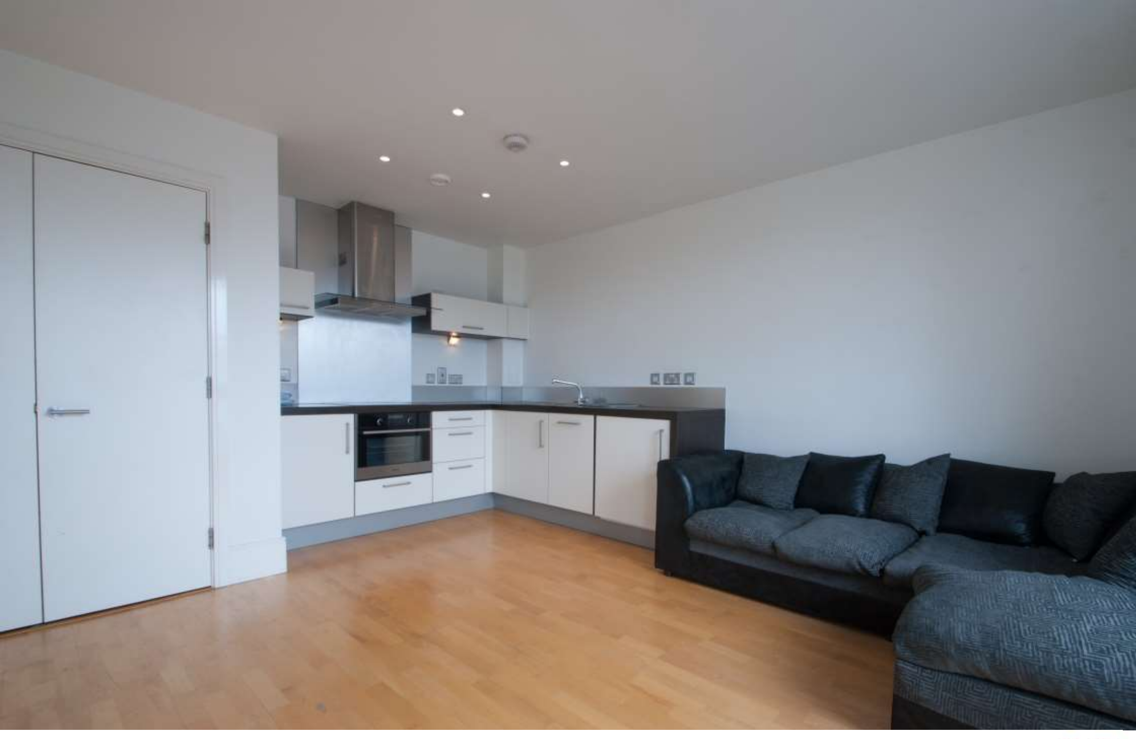
Weststand, Highbury Stadium Square, N5 1FH